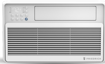
WINDOW INSTALLATION ONLY CCV08, CCV10, CCV12