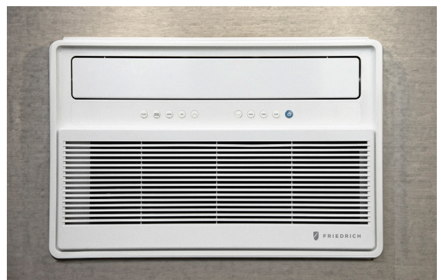
Models CCV15, CCV18, CCV24 can be installed in a wall or window.