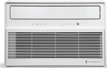
WINDOW OR THROUGH-THE-WALL INSTALLATION CCV15, CCV18, CCV24