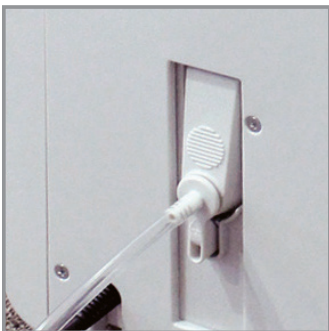
Built-in drain pump