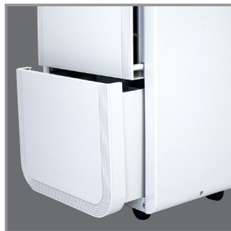
Slide out condensate bucket *16.2 Pints Capacity