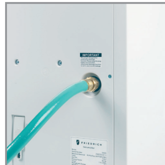
Continuous drain option *Hose not included