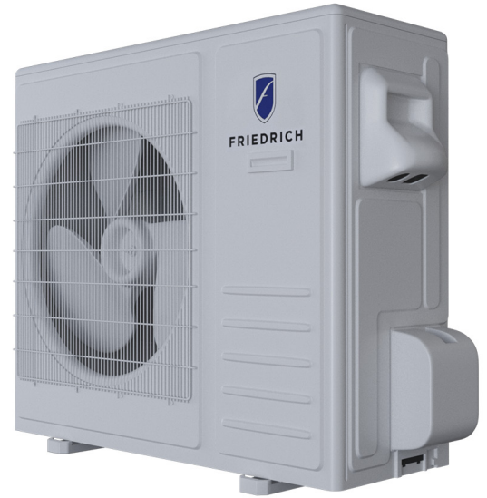
Friedrich Breeze™ Universal Heat Pumps