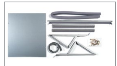
KWIKSB, KWIKMB, KWIKLB