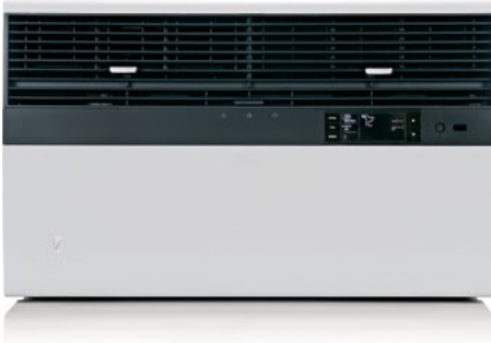
KCS, KCM, KCL, KHS, KHM, KHL, KES, KEM, KEL